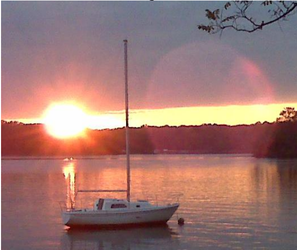
Sunset at Edgewater

Life has a way of hijacking us and holding us hostage. As much as we try to free ourselves from bondage we get sucked back into the busyness and the rigors of life. There comes a time when every woman, especially moms feel overwhelmed, burdened, unappreciated and at times, alone. When these feelings surface, it's time to release and replenish, relax, reflect and rejuvenate the soul.