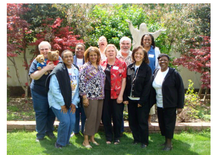
The Happy Attendees

Although a few of the Washington delegation had attended other Regional Encounters, for most, this was their first. We all agreed, however, that this had to be the most POWERful Encounter ever! There was a record seventy-five Cursillistas from five states and the District of Columbia coming together for the mission of evangelization.