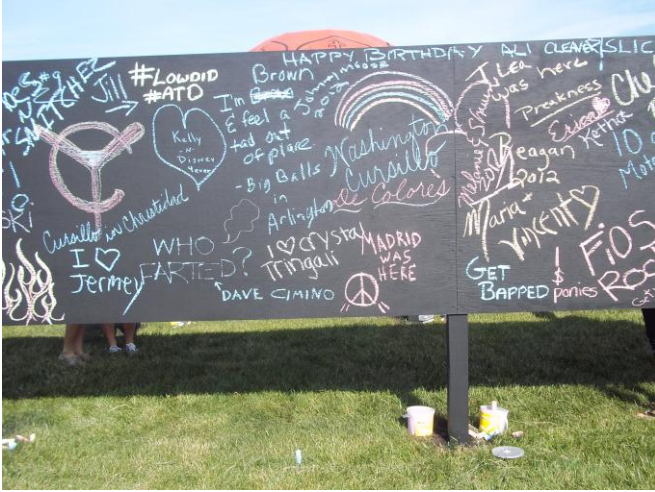
Cursillista in Training!