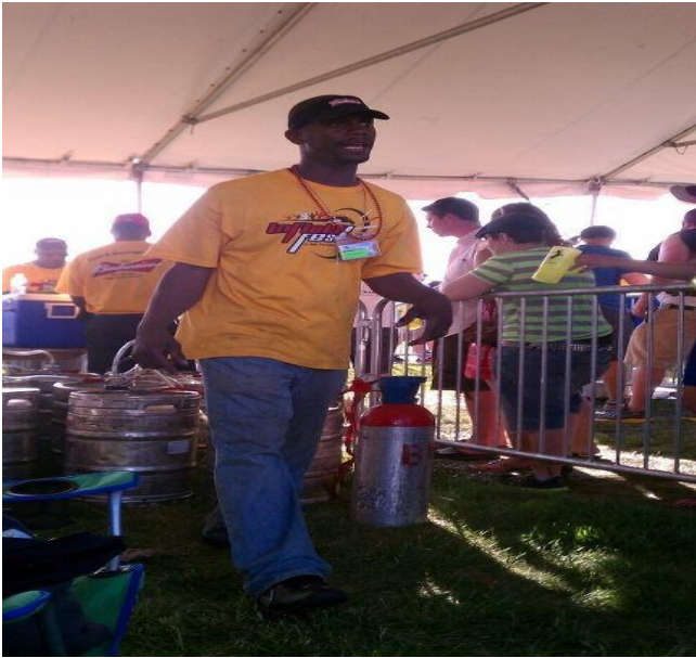
The MOST “Men of St. Teresa” gave new meaning to “Keggers”!