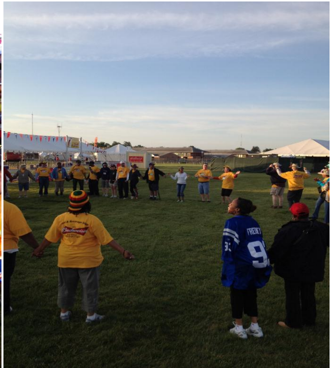
Prayer changed things.