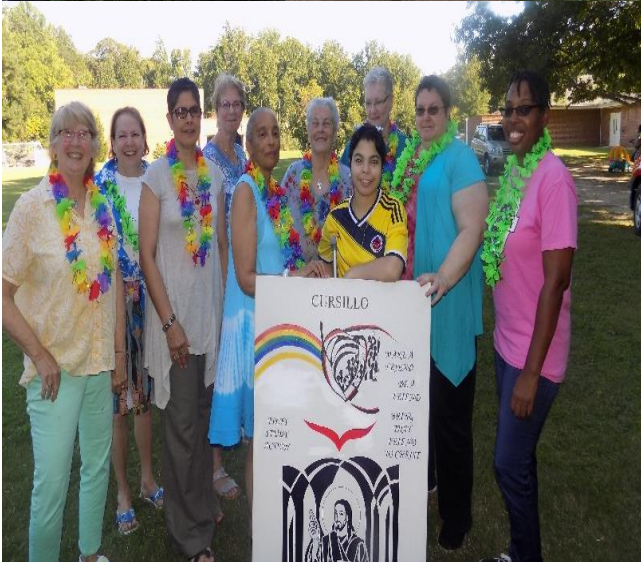
221 st Women's Weekend Team Members