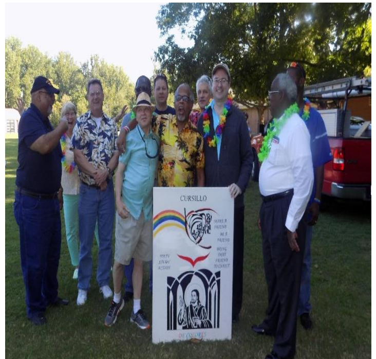
222 nd Men's Weekend Team Members